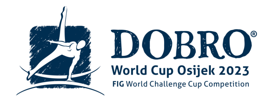
FIG World Challenge Cup Osijek 2023. Osijek, Croatia – June 8 – 11, 2023.